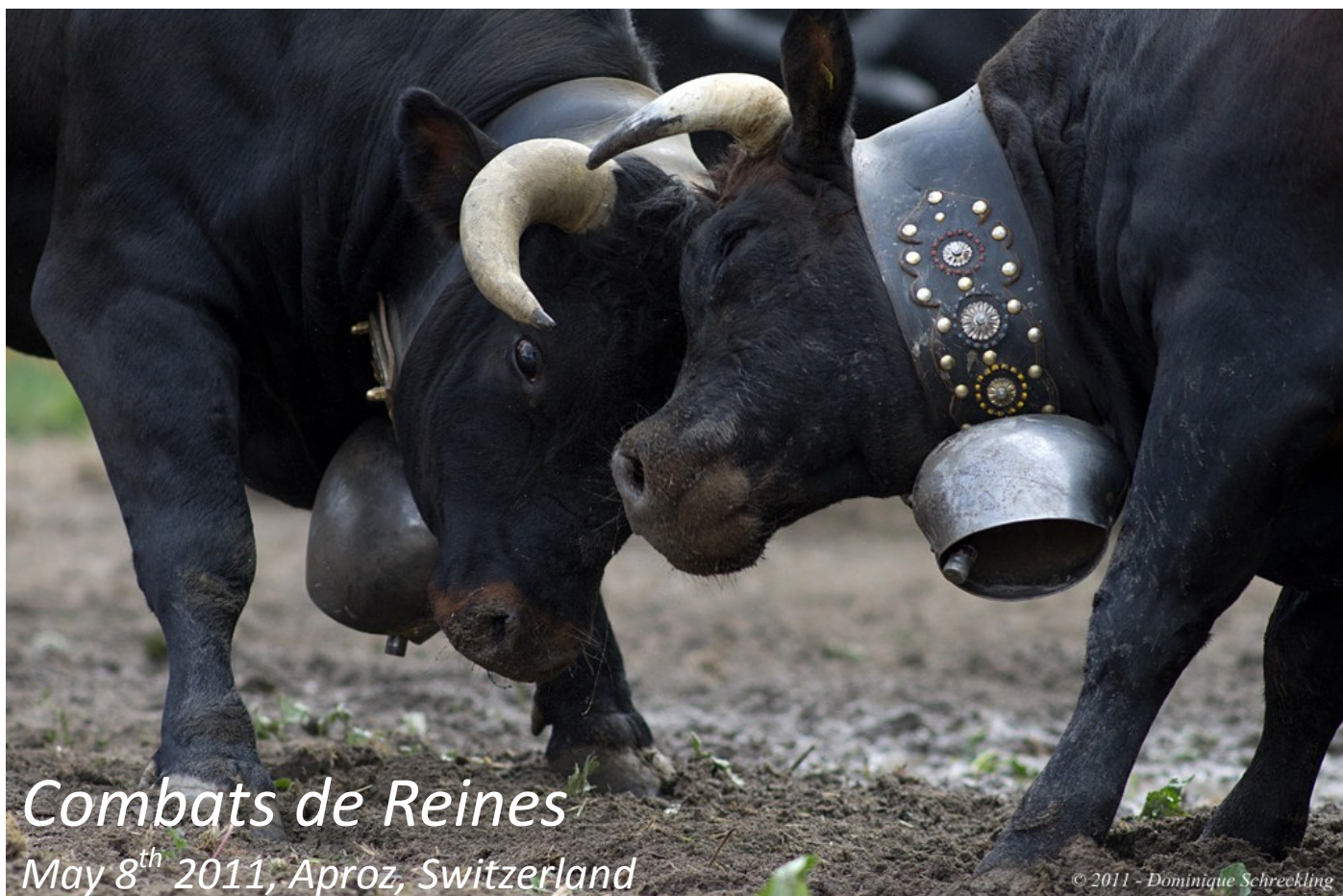
Combats de Reines May 8 th 2011, Aproz, Switzerland